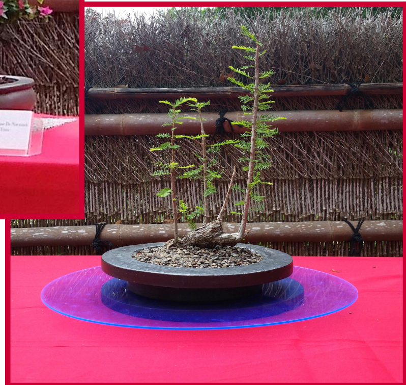
12" TALL CONTEMPORARY BALD CYPRESS