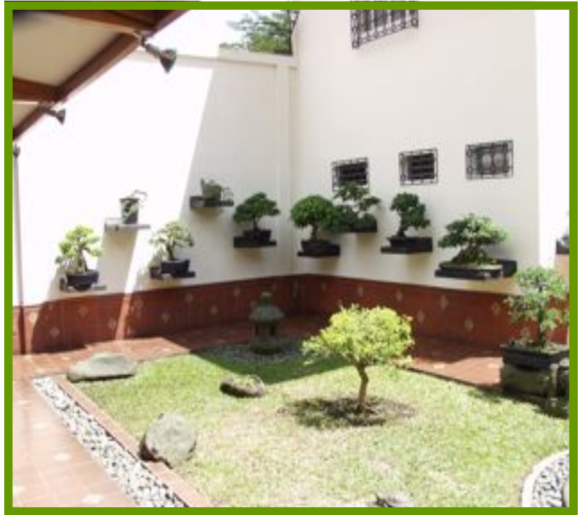
MY DREAM GARDEN