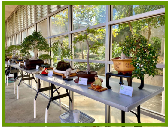
BONSAI ON DISPLAY AND BELOW PEOPLE AT THE SALES TABLE