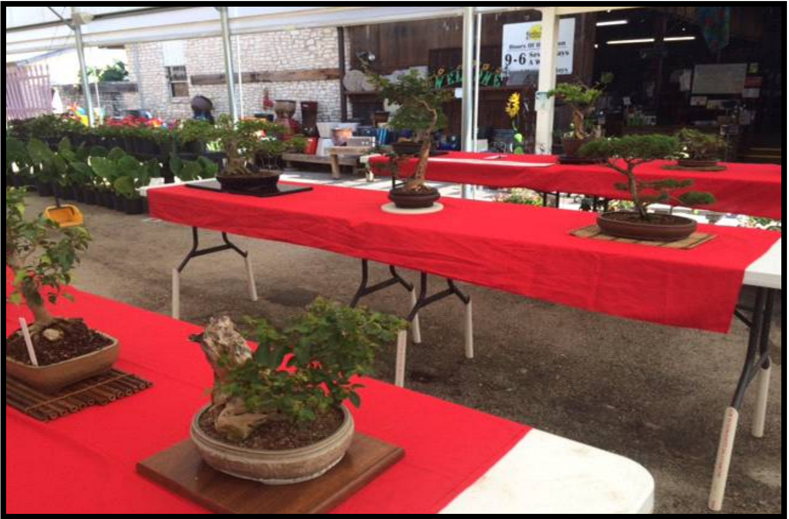
THE EXHIBIT AT THE "GARDEN CENTER"